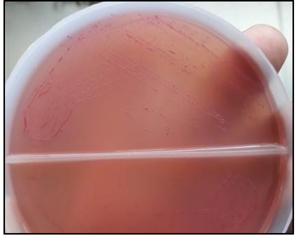
Plate 2: Pin point pink colonies on mackonkey agar